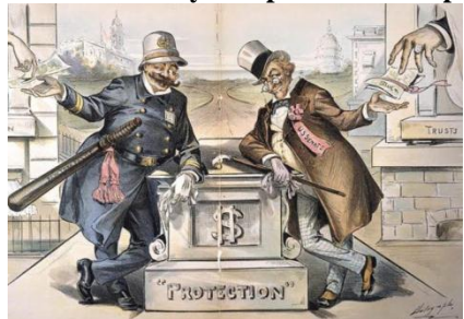
Figure 4.3 : Abuse of authority and political corruption

For ages, artists have addressed the themes of political corruption and power abuse. This kind of art frequently focuses on subjects like politics.