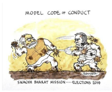
Figure 6.3: Nala Ponnappa - Unraveling the Code

A seasoned political cartoonist Nala Ponnappa enthralls with his brilliant creations. Day after day he skillfully delivers sharp-witted insights into the realm of politics through his thought-provoking cartoons. In his latest masterpiece Ponnappa sheds light on the flagrant lack of respect displayed by rival politicians towards the Model Code of Conduct skillfully capturing the ensuing chaos and disorder that often follows.