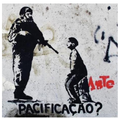
figure 4.4: War and Violence