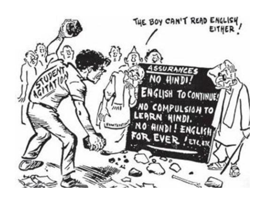
figure 6.1: R.K. Laxman-Anti-Hindi Agitation of Tamil Nadu in 1960s

"The Common Man" character, created by RK Laxman, was well-known for portraying the problems of a common guy in his comic strips. The newspaper "Times of India" featured the majority of his portrayals of everyday people. Along with illustrating the problems that the average person faces, he also sketched portraits of well-known people. If you've read "The Malgudi Days" by RK Narayanan, you've probably noticed the illustration by RK Laxman on the front page. Tamil Nadu was shaken by anti-Hindi agitations in the 1960s, which led to the police shooting and killing a number of unarmed residents. The DMK, a significant political force in Tamil Nadu, is alleged to have benefited from these violent agitations in order to gain power.